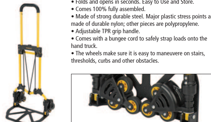
SXWT-FT584: Stair Climber Wheels