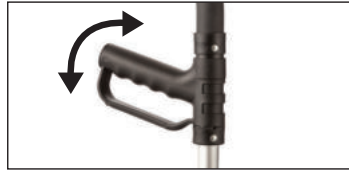
FXWT-707: Adjustable Grip