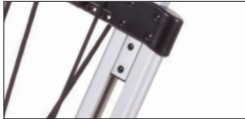
FXWT-706: Double Tube Frame

FXWT-707: Adjustable handles offer knuckle protection and fold in for compact storage.