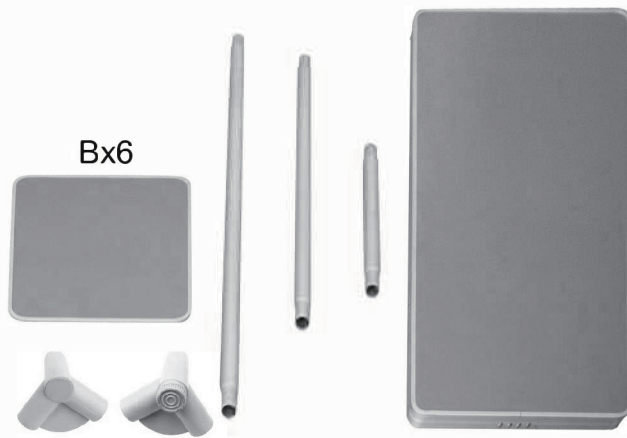
Bx6 Cx4 Dx4 Ex4 Fx4 Gx4 H